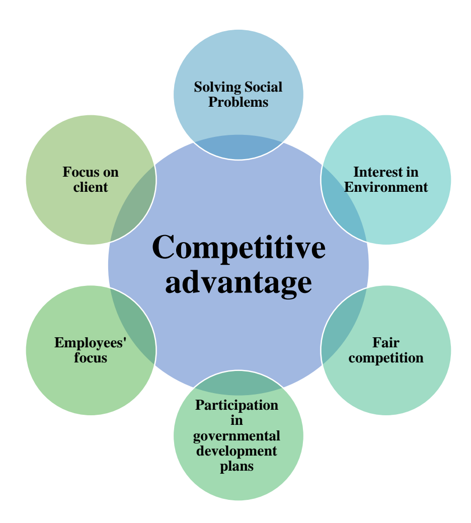
Figure (1.1): The research Variables. (Conceptualized by the researcher)