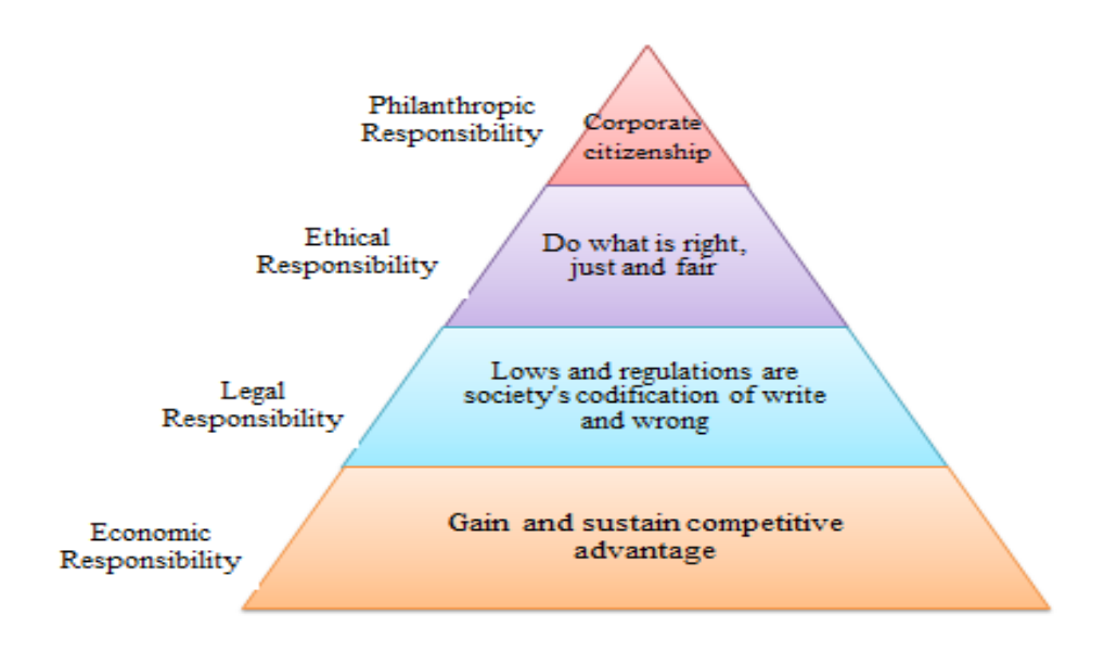
Figure (1.2): The pyramid of CSR